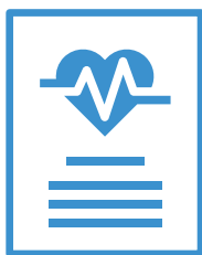
Wide format print