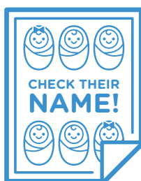
Static cling or poster