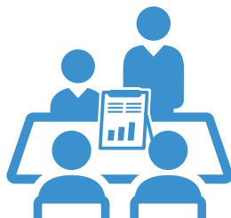
Table toppers and pop ups educate staff