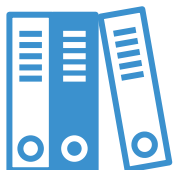
Staff education materials

To meet the Joint Commission's new element of performance hospitals should begin to review their current process of identifying newborns. Hospitals should ensure the identification of newborns is the same across the health system. Also, hospitals can utilize signage in and around the nursery reminding doctors and nurses to review baby's names and double check that the wristbands match the chart. With decades of experience with patient identification and as a trusted partner, Taylor Healthcare can help: